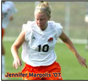
PL Offensive Player of the Year