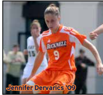
CoSIDA Academic All-America